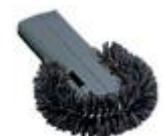
Radiator Brush #1496DG