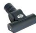
Hand-held Turbo Brush #6179DA