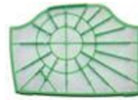
Alternative Motor Filter #1825