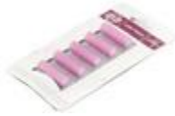
Sebo Fresh Pack of 5 #0496AM