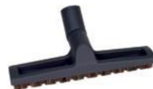
Parquet Brush #1359DG