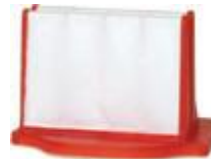
Electrostatic Micro Filter #1875