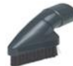
Dusting Brush #1387DG